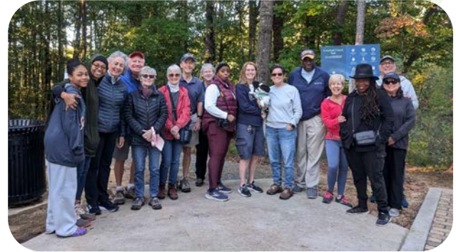
Trail Blazers Program Brings People Together for Guided Walks in Parks

In keeping with our mission of creating, conserving and connecting parks, trails and greenspace, the focus of the Sandy Springs Conservancy in 2024 was all about connectivity! Connecting the community to outdoor amenities through outreach, educational opportunities and programs to get people into the parks to enjoy!