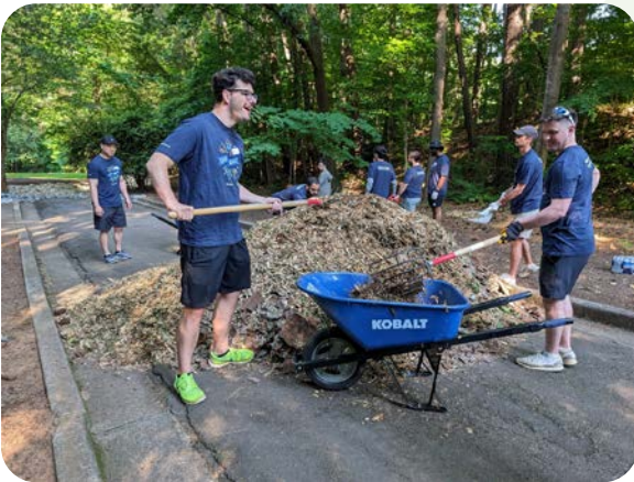
Morgan Stanley Volunteers at Ridgeview Park

In addition to connecting people to parks, the Conservancy also took action in 2024 in a variety of ways to help create and improve parks and paths in Sandy Springs! The Conservancy contributed community support funds to the city of Sandy Springs, organized volunteer park beautification days, provided expertise in design phases and reached out to the community with information about the city's Springway trail plan. Community support funds are made possible by generous contributions from sponsors, grants and individual donors.