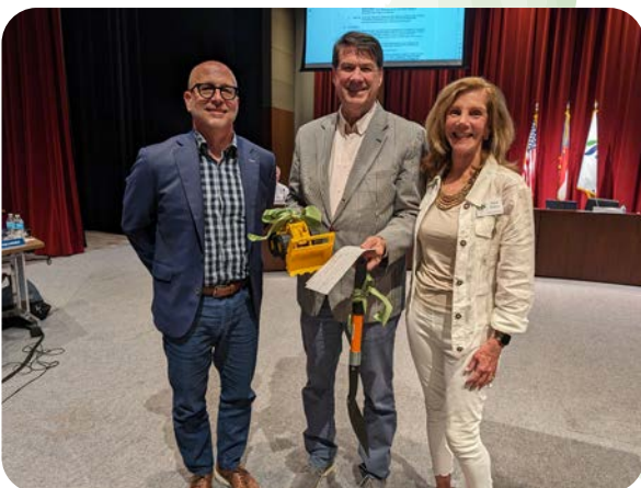
SSC Presented $20,000 to the City for Park Projects

Providing Expertise to the Old Riverside Park Design Committee